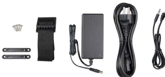
Mounting strap Power adapter Power cord Push button with cord (2 m) and bi-colour LED