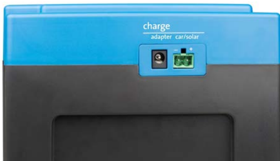
Power adaptor and vehicle/solar input