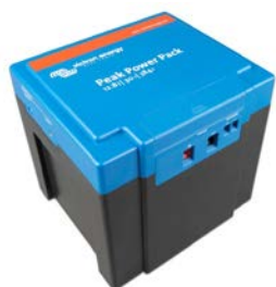
12,8 V 30 Ah