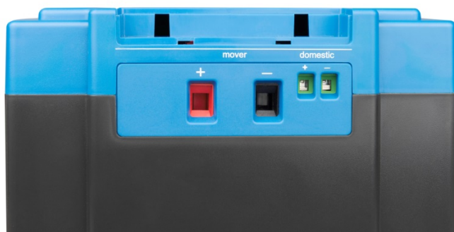
High current (mover) output and low current output