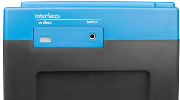
VE.Direct and button